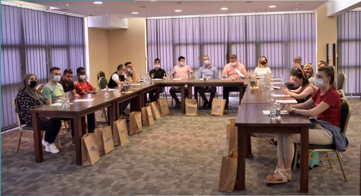
Round table - World Refugee Day