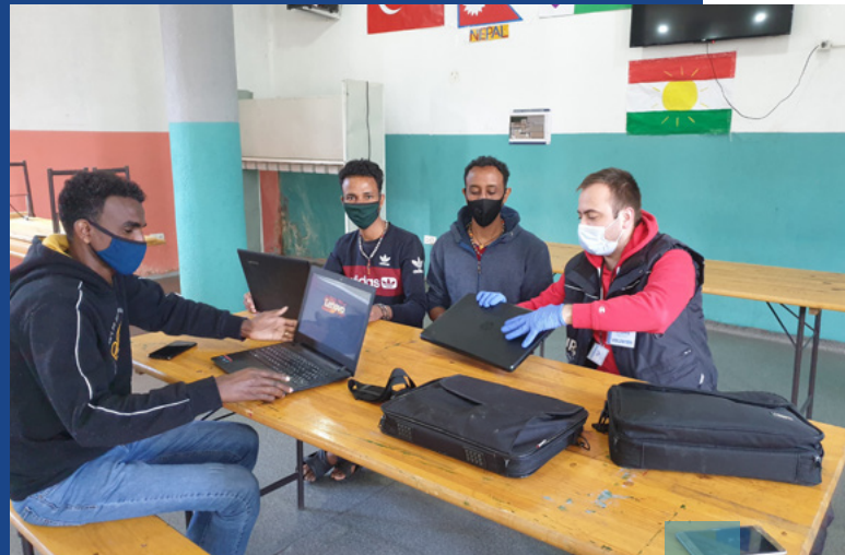
Activities in TRC Borići