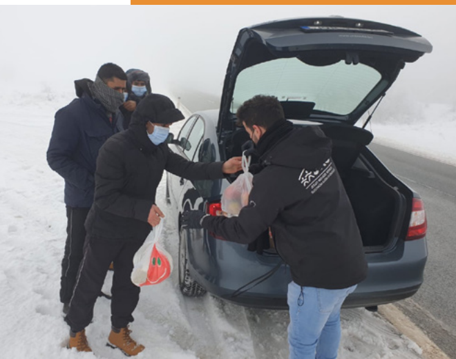
JRS humanitarian assistance