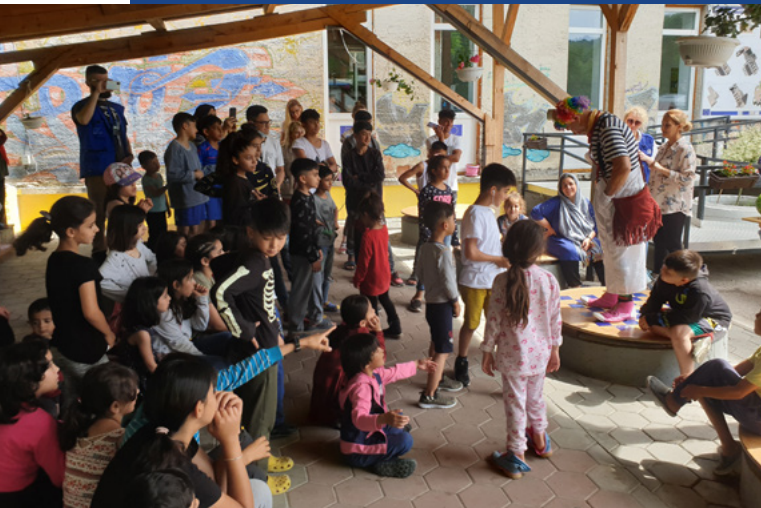
Activities in TRC Borići

Currently, as part of the project, we are holding Bosnian language and informatics workshops at TRC Miral, IT workshops at TRC Borići and a sewing course at TRC Sedra. Also, as part of the project, we conduct social workshops on all important dates, and we organize sports meetings in all centers.