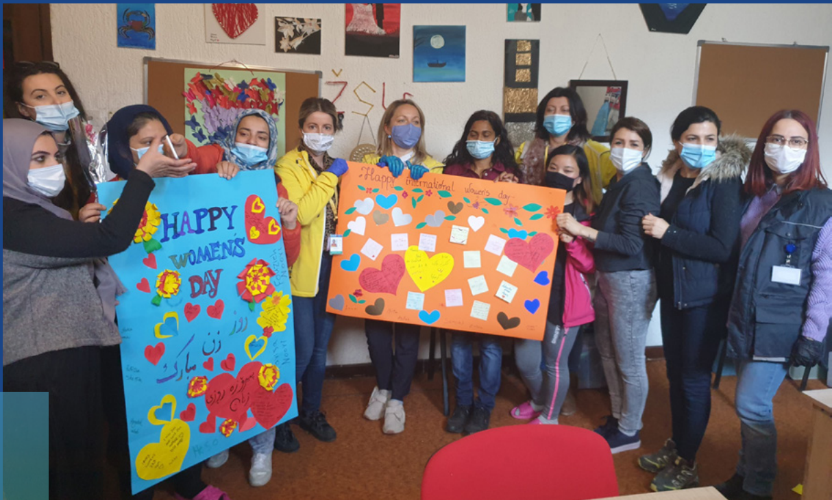
Activities in TRC Sedra