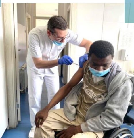
Vaccination of refugees