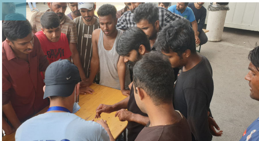
TRC Sedra celebrating Eid