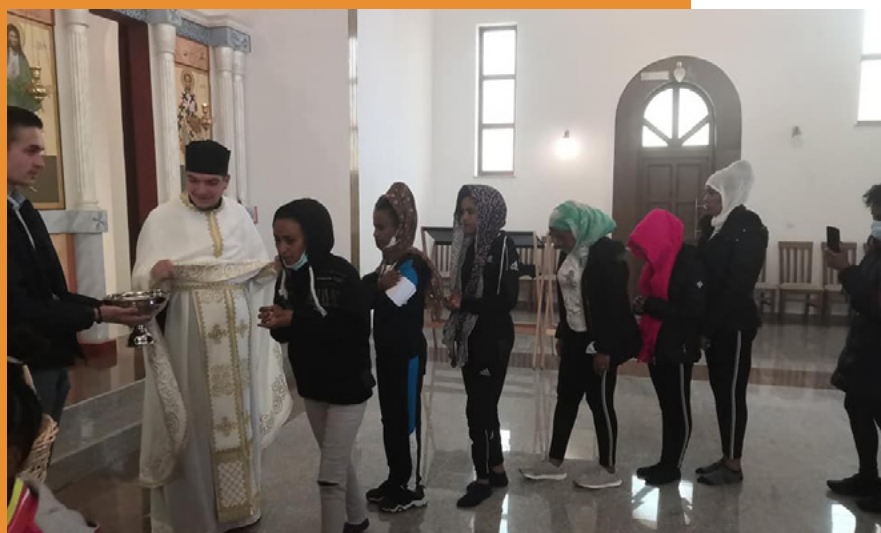
JRS organized a visit to Orthodox church