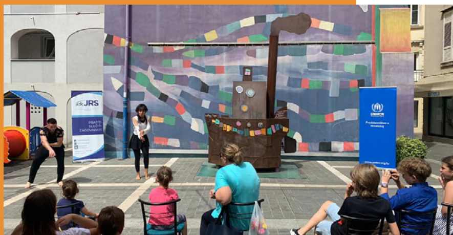
Activities in Rijeka