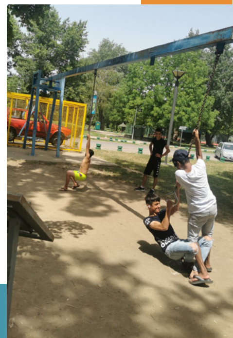
JRS Serbia activities