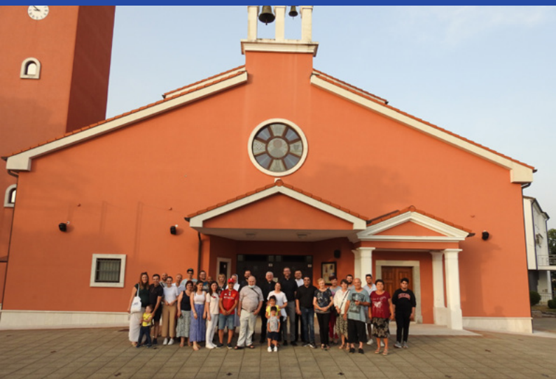
Activities in Rijeka