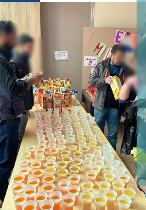
TRC Miral - World Refugee Day